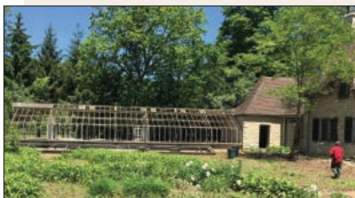
When the Smiths purchased the property in May, 2017, they inherited the shell of the greenhouse and a dilapidated gardener's cottage.