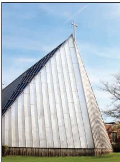
760 East Westleigh Road Chapel, Woodlands Academy of the Sacred Heart

The Loeb Schlossman firm began in 1925 with a Glencoe residence, according to the Art