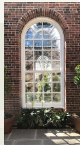
Restoration of the orangery was completed with new, custom-made windows.