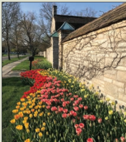
An abundance of fresh, new tulips adorn the entrance to the estate, signaling new life within.