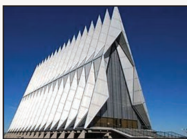
The United States Air Force Academy Cadet Chapel, completed in 1962