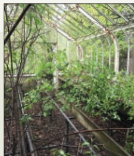
The Smiths were greeted with Mother Nature's planting design.