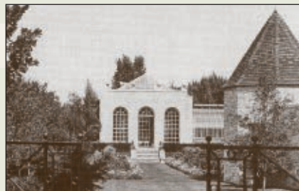
The original Adler-designed orangery on the property in the 1930s.