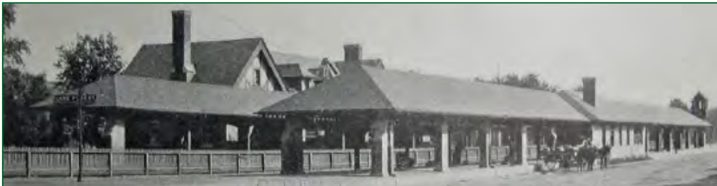
An early view of Lake Forest's east side train station.

NON-PROFIT ORG U.S. POSTAGE PAID PERMIT NO. 184 LAKE FOREST, IL 60045