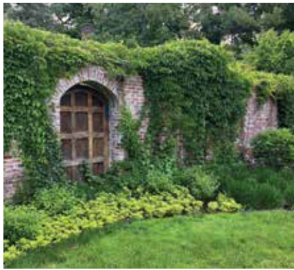
366 Bluff's Edge Drive

This annual program plays a crucial role in recognizing and encouraging efforts to safeguard and conserve the cultural, historical, and landscaped heritage in our community. Over the past 35 years more than 250 properties have been honored.