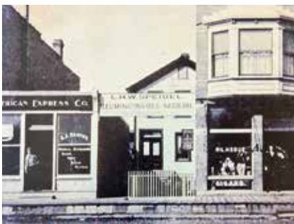
Western Ave. ca. 1890s

Market Square was completed just prior to the U.S. joining World War I, though built with profits from the conflict dating from August of 1914. The war ended abruptly in late 1918, slicing into the economic boom, as did both the 1918–20 influenza epidemic and the 1920 Red Scare. The economy only revived by 1925. Local resident and co-author with Burnham of the 1909 Plan of Chicago Edward H. Bennett's planning firm segued from major central downtown plans to, by 1923, zoning plans