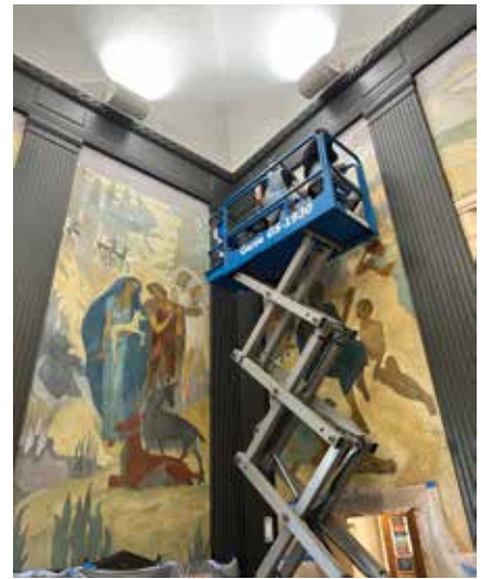
Rotunda, Lake Forest Library

Meanwhile, watch for ongoing projects of renewal and restoration at our beloved library which might include a master plan to consider repurposing of spaces, evaluating the location of collections, infrastructure and ADA needs including HVAC and the elevator, restoration of the courtyards, masonry repair, and appropriate furnishings for the foyer. The best is yet to come!