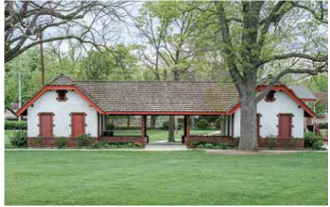
848 N. Summit Ave., warming hut at West Park, Frost, 1923

As the City of Lake Forest embarks on plans to improve its Central Business District, or downtown, the town's remarkable heritage of planning for development provides a valuable historic context.